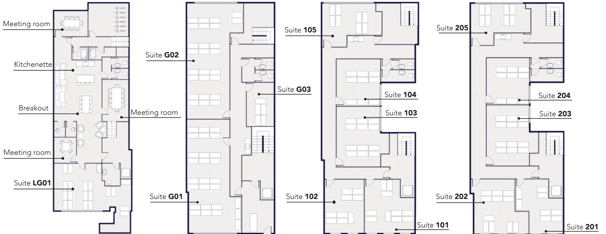
Lower Ground Floor ..... Ground Floor ..... First Floor ..... Second Floor

W/ workpad.co.uk E/ enquiries@workpad.co.uk T/ 020 7788 7507 I/ @WorkPadUK